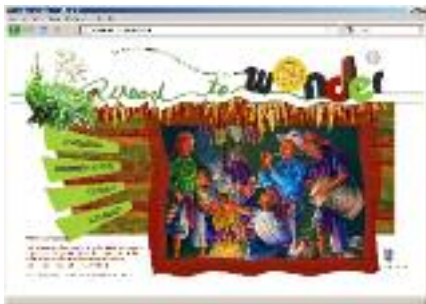
The Weed to Wonder site will explore how humans change corn and how corn changed human society.

scientists at Cornell University. Under this project, the DNALC will develop a multimedia internet site, Weed to Wonder . We will tell the remarkable story of the corn plant's amazing rise—from a common weed, to staple food and religious icon of Native Americans, to modern hybrid cultivar, to versatile and ubiquitous component of processed food, to precursor of clothing and motor fuels, to pharmaceutical factory. Weed to Wonder will celebrate this uniquely American success story and provide a case study of the interaction among science, technology, and society (STS). The site will open an internet window on modern research on plant genomes, as well as a time machine back into the social and scientific history of agricultural breeding. The goal will be to show the continuity of research on corn—from Native American agriculturalists to agricultural breeders, corn geneticists,