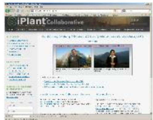
The video interface at the iPlant Collaborative website includes interview clips of 143 plant and computer scientists.

At year’s end, we received approval from iPlant management to embark on an EOT demonstration project to develop an educational platform for gene annotation and comparison. Annotation is the process of discovering the biological information in a DNA sequence, viewing genes in the context of a chromosome, and relating them to other organisms. The analysis of DNA sequence entails a number of cumulative steps—assembling short sequences into “contigs,” predicting genes and other functional elements, and merging gene evidence from RNA and other species—which is termed a “pipeline” or “workflow.” Although masses of free DNA and gene data are available, each step of the workflow requires a different tool, and various tools and data sources often are not compatible. Our objective is to develop an easy-to-use interface that will allow students to easily find DNA data and seamlessly move it through several key stages of the annotation pipeline. We envision a desktop object that merges