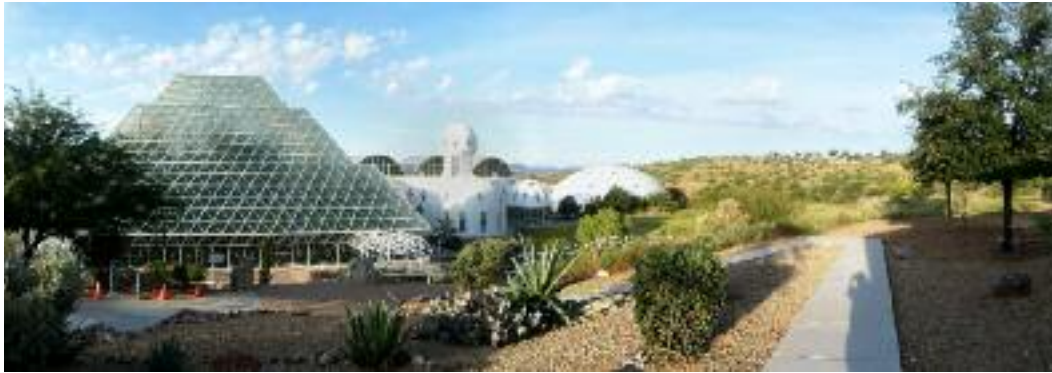
Biosphere II in Arizona made a stunning backdrop to the iPlant Collaborative Grand Challenge workshops.

After a spring kickoff symposium at Cold Spring Harbor Laboratory, the iPlant Collaborative hosted a series of six workshops for plant and computation researchers to brainstorm “grand challenges” in plant science. These workshops were hosted at Biosphere II, in Arizona, and drew together a multidisciplinary group of computational scientists and researchers working at all levels of plant function and organization: molecular biology, genetics, genomics, biochemistry, cell biology, physiology, plant breeding, systematics, ecology, and evolutionary biology. Beginning in 2009, Grand Challenge Teams will work with computer scientists at the University of Arizona and CSHL to develop a cyberinfrastructure of Discovery Environments , where plant researchers can share and analyze data in an unprecedented fashion. As a member of the iPlant Education, Outreach, and Training (EOT) component, the DNALC will work with each project team to create educational interfaces to the scientific tools and databases. In this way, students and teachers can work with the same data, using the same tools, and at the same time as high-level plant researchers. This will enable students to literally look over the shoulders of plant researchers as they, for example, understand the mechanisms that could enable crop plants to rapidly respond to global climate changes.