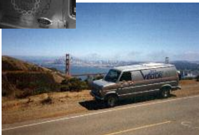
The Vector Van approaching the Golden Gate Bridge in San Francisco.

In 1986, we obtained funding from Citibank to develop a mobile “Vector Van”—a Ford Econoline with a silver paint job and loaded to the ceiling with pipettes, centrifuges, and water baths. With independent funding from small foundations and biotech start-ups, we took our DNA show on the road, conducting week-long teacher workshops at six sites across the United States. On the last leg of the trip—from Milwaukee, Wisconsin, to Davis, California—the Vector Van was piloted by a German graduate student who had just received her driver’s license, with a high school intern as copilot. That same year, we initiated a cooperative agreement with Carolina Biological Supply Company to develop reagents and kits to accompany the DNA Science curriculum.